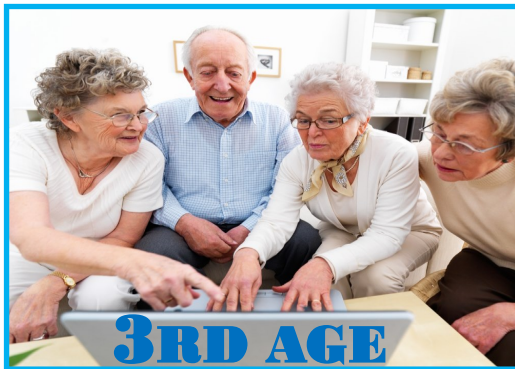
We are a society of retired or near-retired people (in the Third Age) who want to make new friends, keep our minds active and have fun . . . .

The skills and knowledge from our members' "previous lives" are a precious resource for the group.