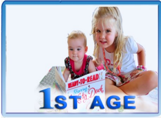
Childhood and learning