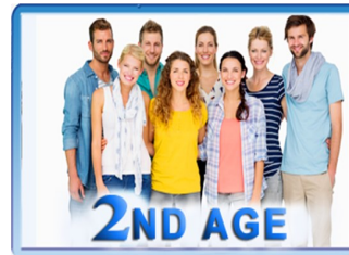
Earning a living and having a family