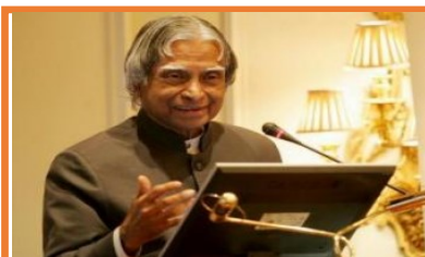
APJ Abdul Kalam at the Poetry Society.