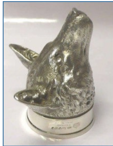
A Victorian Silver Stirrup Cup