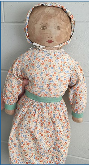
A kitset doll — the face was already painted, so you just had to stuff it.