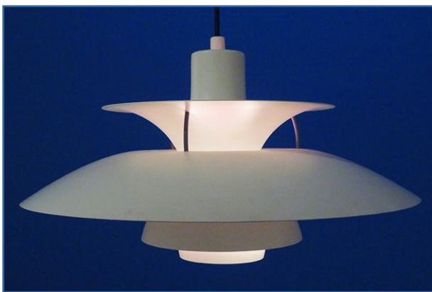
Paul Henningsen PH 4/3 Lamp 1966