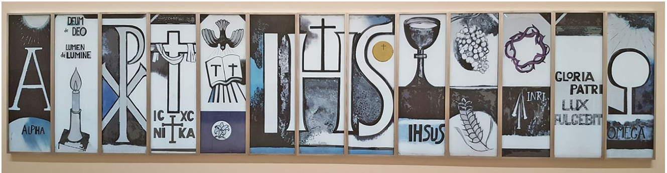
One of the clerestory windows for the Convent Chapel of the Sisters of our Lady of the Missions, Auckland 1965

Art appreciation enjoyed a movie on Degas in September at the Matakana Cinema then Colin McCahon and a Denmark Design exhibition at the Auckland Gallery.