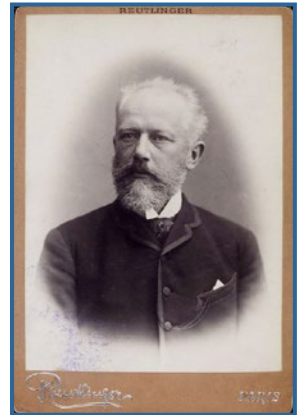
Pyotr Ilyich Tchaikovsky by Ruetlinger c1888