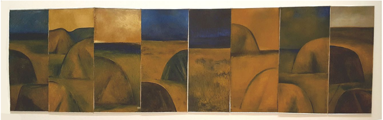
Landscape theme and variations (series A) 1963