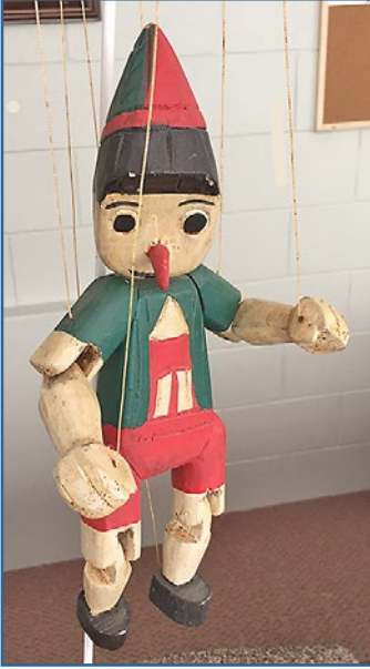
String puppet Pinocchio