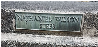
The plaque on steps - opposite the Bridge plaque