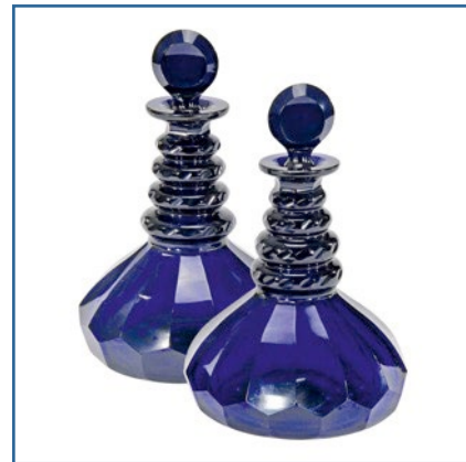
The 'Rodney' — a heavy-based ship's decanter — designed for stability at sea

It was decided at the October meeting that, since it was held over Labour Weekend and many of the members were away, that the two talks would be repeated at the first meeting in February next year — so more details in the next newsletter!