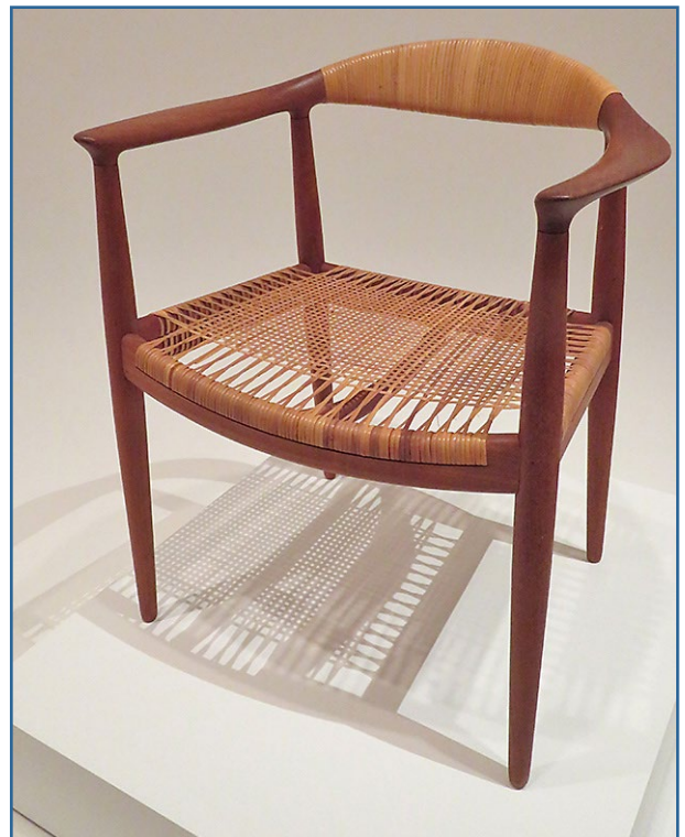
Denmark Design Arm Chair