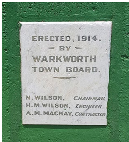
The plaque on the bridge pier