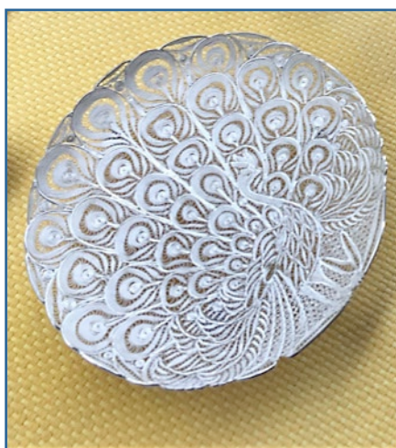
An intricate silver filigree peacock dish.

Nigel's display of items illustrated a wide variety of silver-working methods — from those worked in heavy beaten silver to those created in delicate silver filigree. The items represented a wide range of cultures and featured a full range of silver use — from cutlery and household wares to jewellery and ornamental use.