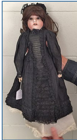
A Victorian model.